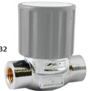
D44931 / D44932