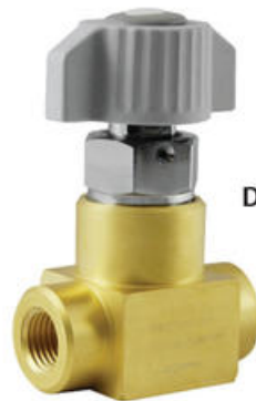
D43712 / D43715